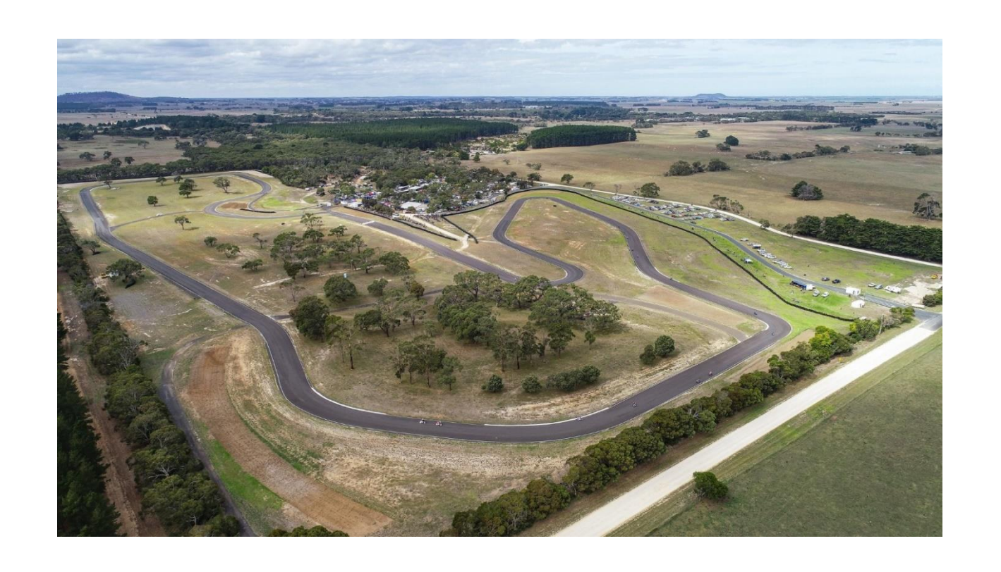
Track Layout Racing Clockwise McNamara Park Raceway, Mount Gambier, South Australia